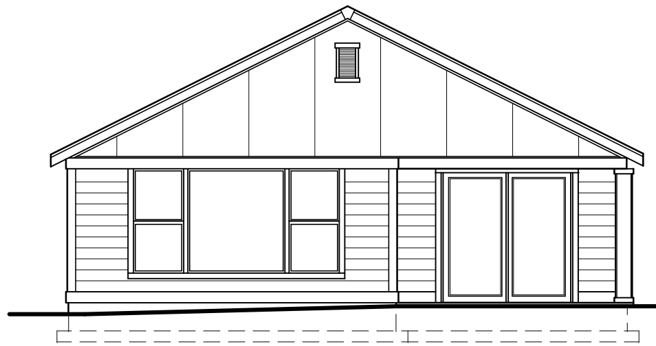
BACK ELEVATION SCALE: 1/8" = 1'-0"